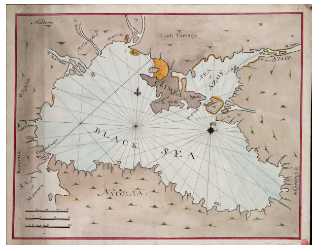
An early 19th century map of the Black Sea. National Maritime Museum, Greenwich, London

The treaty made the Black Sea neutral territory, closed it to all warships and prohibited fortifications and the presence of armaments on its shores.