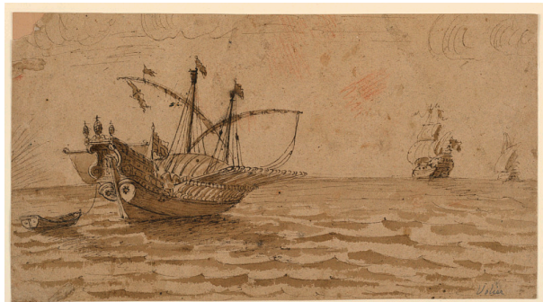
18th century war ships at sea. Pierre-Jacques Volaire

Both states mutually declared that neither side would prepare any naval armaments beyond the peacetime establishment, both would limit their number of naval ships placed 'in the water,' and both would agree to provide preliminary notification if some different arrangement was found necessary.