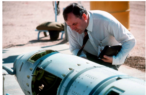
A Soviet inspector examines a BGM-109G Tomahawk ground launched cruise missile (GLCM) prior to its destruction.

In the second case, along with the Conventional Forces Europe Treaty (CFE; 1990) and the Vienna Document (VD; 1990, updated in 2011), the Open Skies Treaty (OST, 1992) constituted a mutual reinforcing framework of arms control and confidence and security building measures (CSBMs) in Europe.