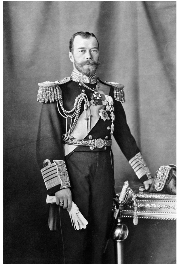
Tsar Nicholas II of Russia initiated the Hague Peace Conference of 1899.

The conference led to the signing of the Hague Convention of 1899. This Convention consisted of three main treaties and three additional declarations, which together established rules for declaring and conducting warfare as well as the use of modern weaponry and set up the Permanent Court of Arbitration