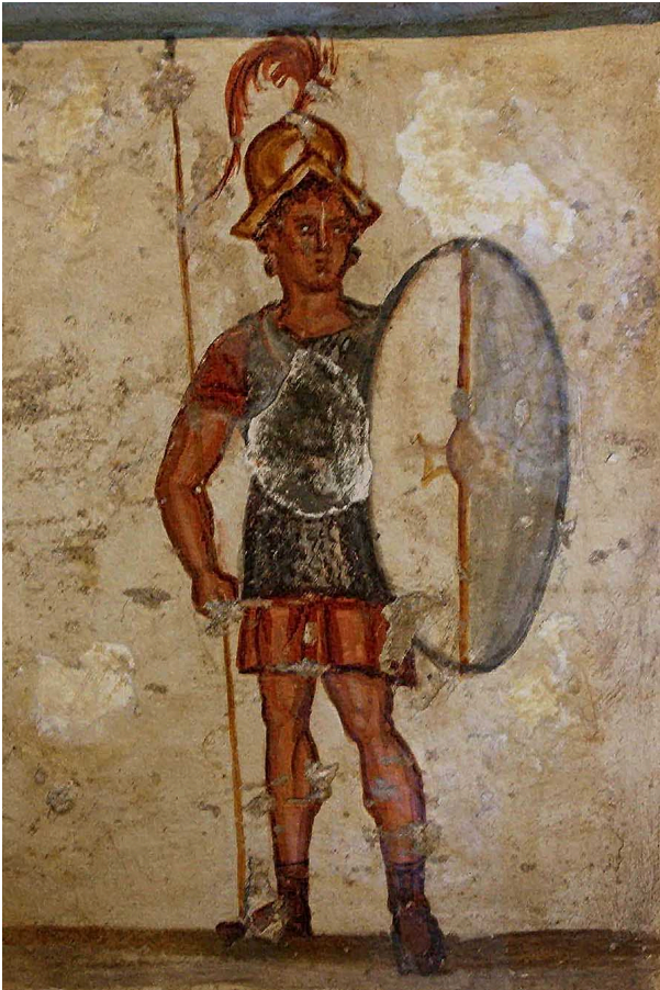
Fresco of an ancient Macedonian Greek heavy infantry soldier wearing mail armour, 3rd century BC.