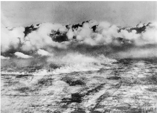
Gas Attack by the German Army on the Osowiec Fortress, Poland, during the 1st World War