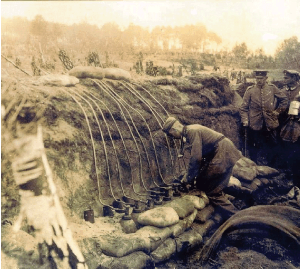
German battery of chlorine gas cylinders being prepared for an attack, awaiting the right weather conditions to prevent blowback; similar to the arrangement at Hill 60 in May 1915